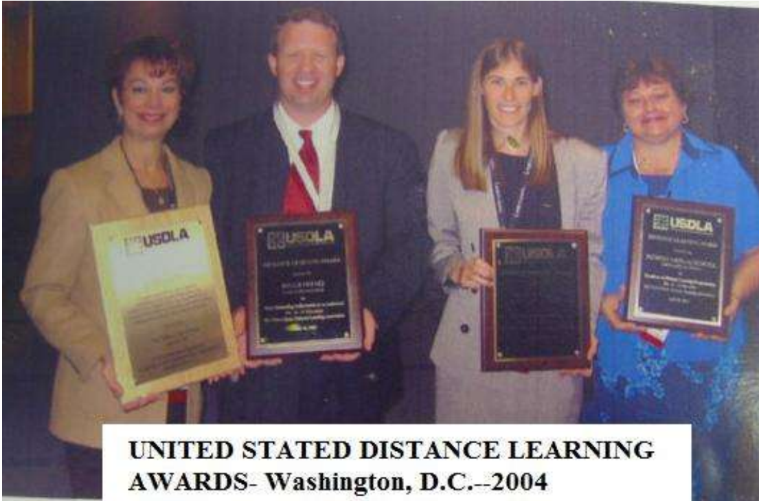
UNITED STATES DISTANCE LEARNING AWARDS- Washington, D.C.--2004